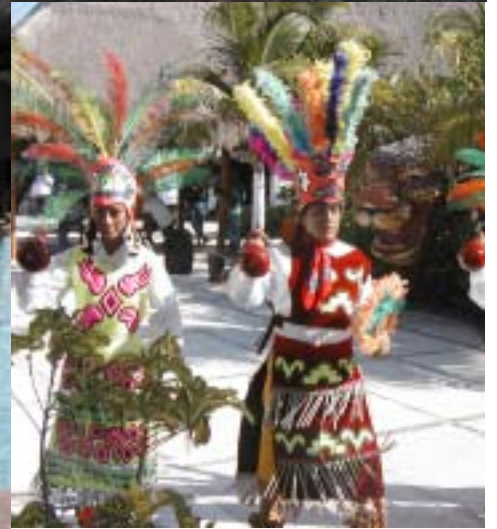
Costa Maya, Mexico February, 2004