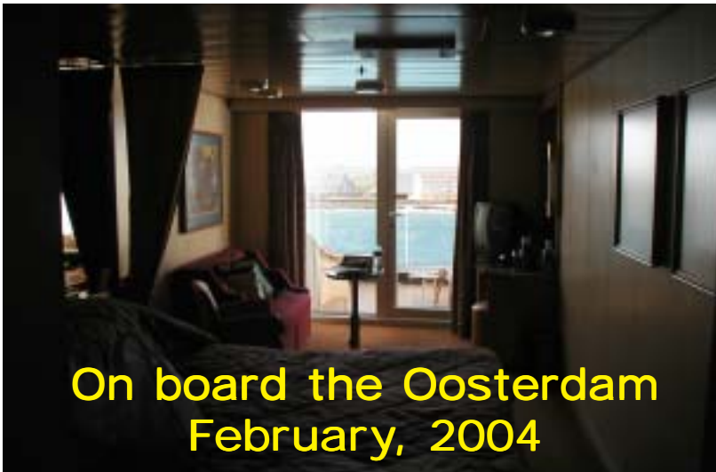
On board the Oosterdam February, 2004